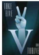
"Take Five and Thrive"

Twice yearly report on the Kraków office market produced in association with Colliers International.