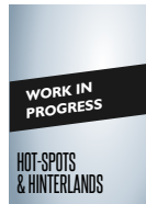
"Hot-Spots & Hinterlands"

White paper on talent management in association with Lumesse and Alexander Mann Solutions.