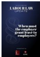
Labour Law Update

Quarterly report presenting key facts about the business services and technology market in Kraków.