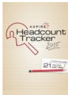
ASPIRE Headcount Tracker 2015

Annual report based on headcount in the technology and business services in Kraków, capturing its current size and forecasting and trending its development.