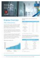
ASPIRE Office Market Update, H1 2015

Monthly update on Polish Labour Law in association with CDZ.